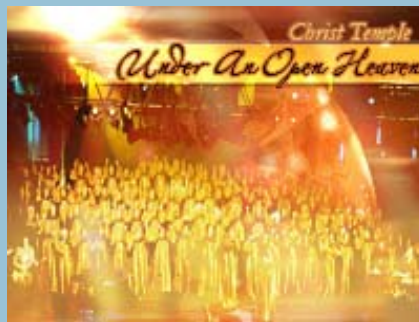
Christ Temple Choir & Praise Team